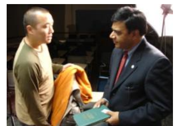
Guest & Caf Dowlah